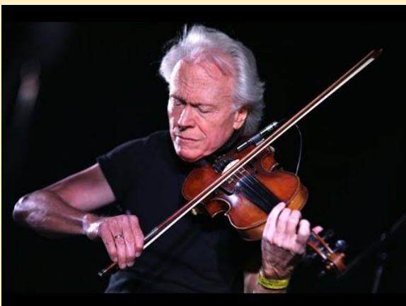
SWAMP BEAT BOOGIE--2022